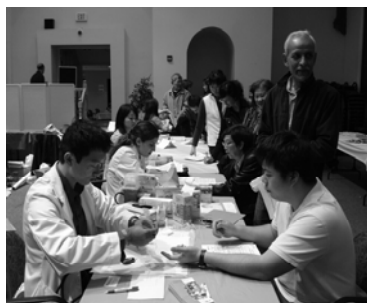
Participants have their blood tested for levels of glucose by Ohio State University medical student volunteers

various screenings were provided, including: acupuncture, blood pressure, cholesterol, dental, diabetes, HIV, inner ear, mammogram, and massage therapy. Free interpretation services in Manda-